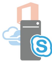
Sfb Online Phone System

Phone System is UNAVAILABLE to all subtended Sfb clients