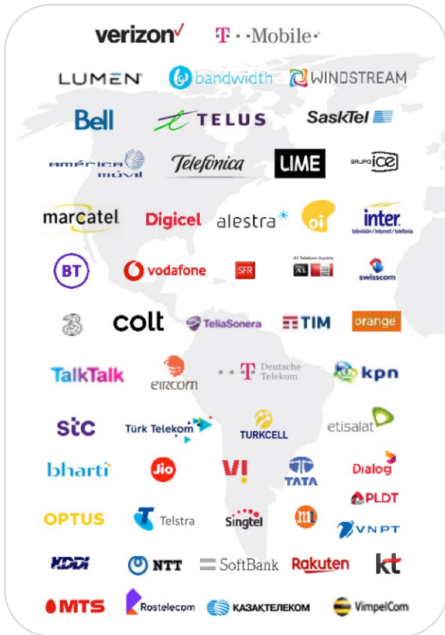
Telco and Mobile

Large and Diverse Service Provider and Enterprise Customer Base