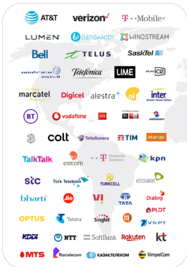
Telco and Mobile

Large and Diverse Service Provider and Enterprise Customer Base