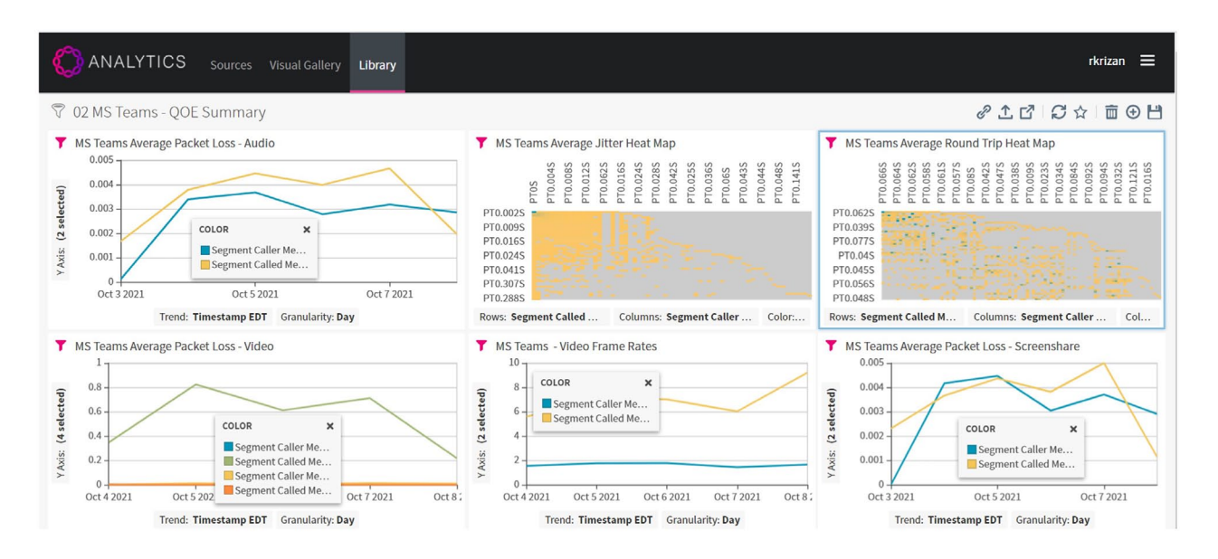
Figure 2 - MS Teams QoE Dashboard Visualizing Call Quality and Performance

Ribbon Analytics for Microsoft Teams lets organizations depict and analyze RTC KPIs and other data collected from Teams, Ribbon network elements, and various third-party sources. A graphical dashboard provides out-of-the-box and customizable widgets for exploring network utilization stats, service quality indicators, and fault management information. Administrators can visualize and examine Teams-to-Teams call data and Teams-to-PSTN call data to identify trends, isolate performance bottlenecks, and pinpoint call quality issues.