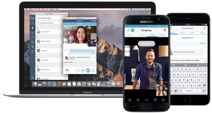
Smart Office Unified Communication Clients